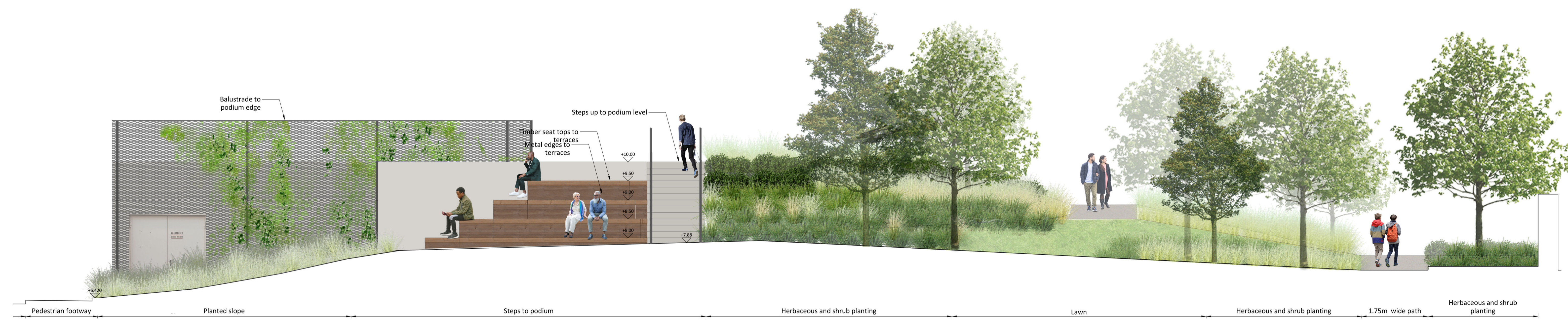
ELEVATION B-B Landscape section along seating and planting terraces